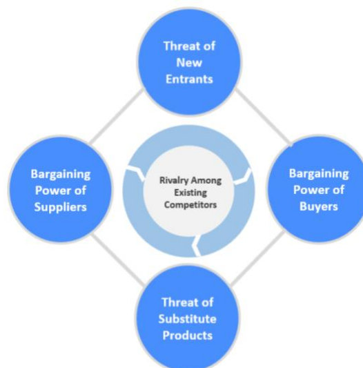
Figure 1. Porter's five forces model

Porter's Five Forces is a renowned analytical framework introduced by Michael Porter to evaluate the competitive dynamics of an industry (Porter, 2008). This model examines five essential forces: the threat of new entrants, the bargaining power of suppliers, the bargaining power of buyers, the threat of substitute products or services, and the intensity of competitive rivalry. By comprehensively analyzing these forces, businesses can assess the overall attractiveness of an industry, identify potential risks and opportunities, and formulate strategic initiatives to attain and sustain a competitive advantage.