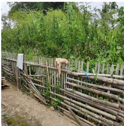
Figure 2: Land boundary markers along with SPPT-PBB

The society is convinced that there is no need to register land anymore because it is enough with proof of ownership which they consider a strong legal force in the ownership of their land rights. The following are images that the society considers strong evidence of land ownership: